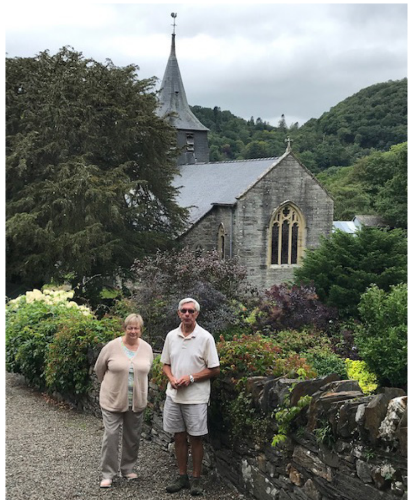
Saint Twrog's Church is in the village of Maentwrog in the Welsh county of Gwynedd, in the Vale of Ffestiniog, and in the Snowdonia National Park.