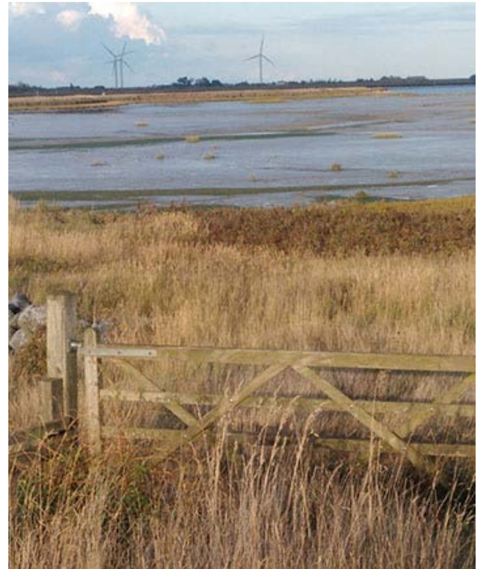
Wallasea Island last Thursday afternoon